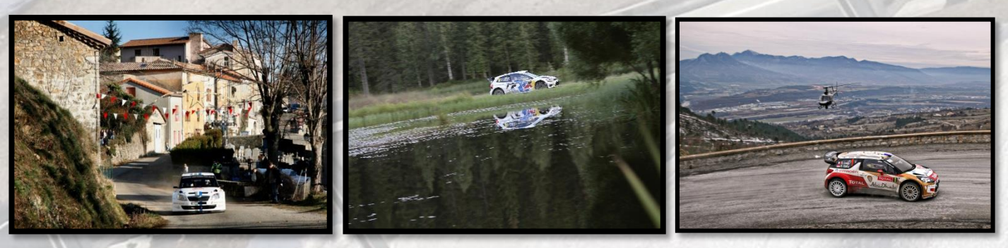
If bad weather conditions prevent helicopter take-off (pilot being the sole judge), 50% of the total reservation amount will be refunded by bank transfer within the week after the rally; the remaining 50% cover the helicopter set-up and immobilisation costs.