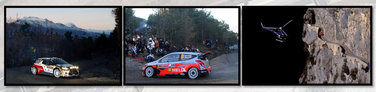
If bad weather conditions prevent helicopter take-off (pilot being the sole judge), 50% of the total reservation amount will be refunded by bank transfer within the week after the rally; the remaining 50% cover the helicopter set-up and immobilisation costs.