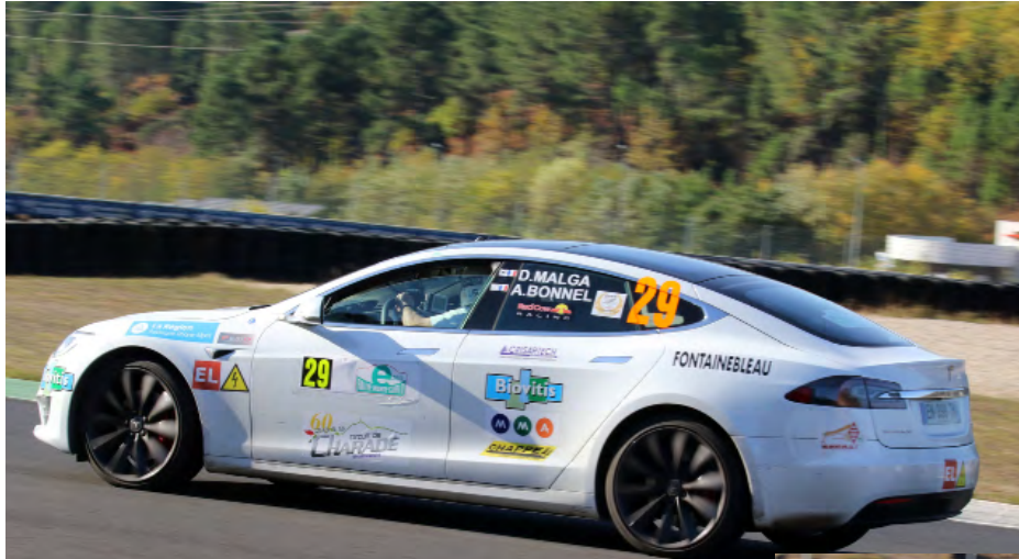
1° : Malga / Bonnel - Tesla - Electric