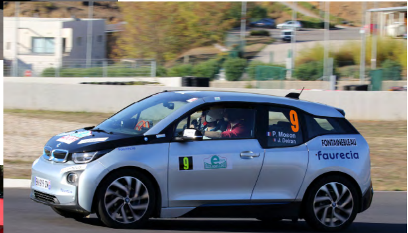
2° : Moson / Delran - BMW i3 - Electric