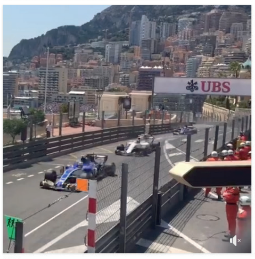
7,3 K vues

Depuis la terrasse du Louis XV – Alain Ducasse à l'Hôtel de Paris, vous serez aux premières loges pour les Grands Prix ! № Réservez dès aujourd'hui : <a href="http://sbm.to/uwgSlc">http://sbm.to/uwgSlc</a>. #GPMonaco