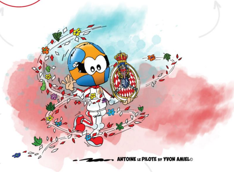
ANTOINE LE PILOTE BY YVON AMIEL ©

TRIEZ VOS DÉCHETS ET UTILISEZ DES POUBELLES RECYCLE YOUR WASTE AND USE GARBAGE BINS